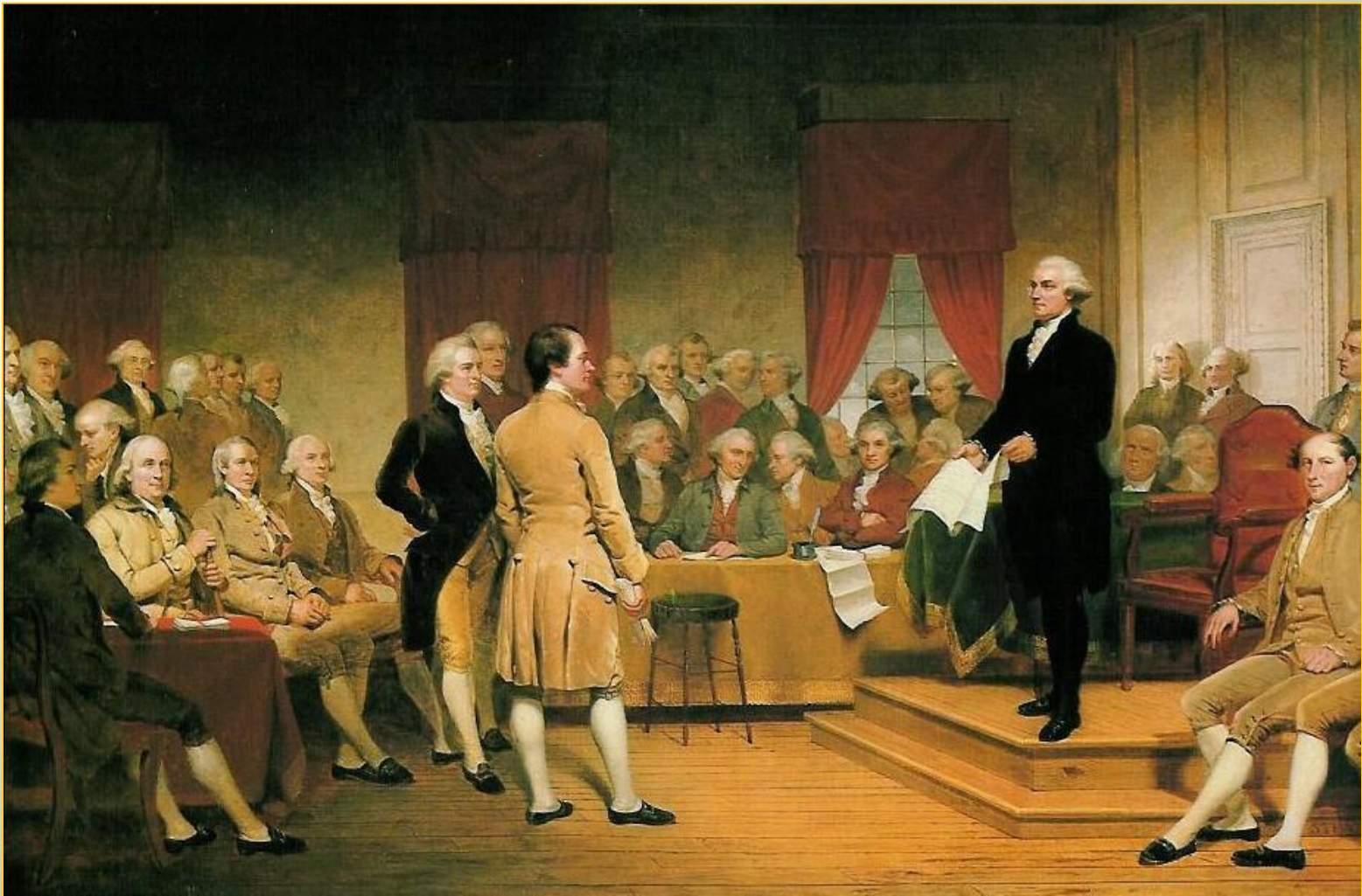
Internet photo of work by Junius Brutus Stearns, 1856