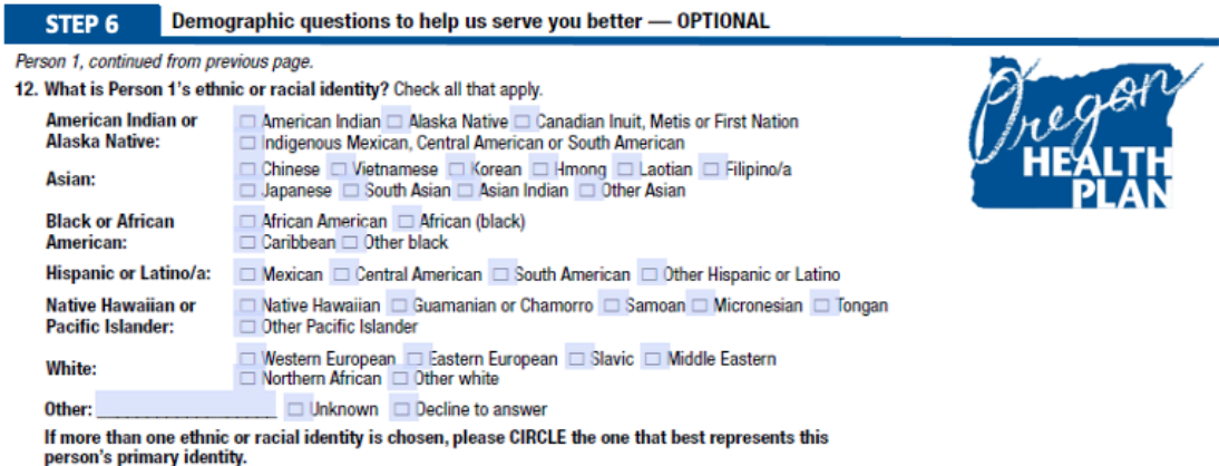
Figure 7. MENA Response Option: Oregon’s Paper Application Race Options

The majority of states’ applications (43 paper and 27 online) ask individuals to indicate if they are “American Indian/Alaska Native” (AIAN). If individuals indicate “yes” to that option, they are, in many cases, directed to select from more detailed conceptual checkboxes and/or indicate if they belong to a specific federally recognized tribe. Some states provide dropdown or checkbox options for those responses, while others allow for a write-in response (on paper applications)—consistent with Census research findings that data collection is improved when a “write-in line” is used to collect detailed AIAN responses (see BOX page 4).